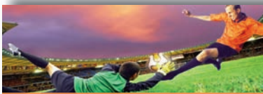
UST World Cup

The Center for Faith and Culture and the Congregation of the Holy Spirit will host "The Holy Spirit and Evangelization," a five-week lecture series that will explore the presence and work of the Holy Spirit in the life of the Church and experienced through culture. The lectures will be held from 7 to 9 p.m. Wednesdays, April 7 – May 5 at St. Mary's Seminary, 9845 Memorial.