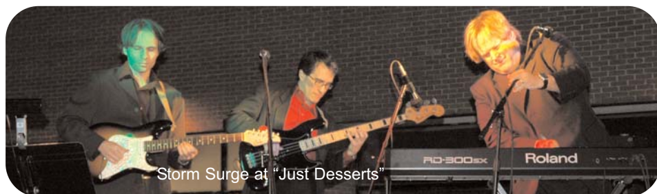
Storm Surge at "Just Desserts"