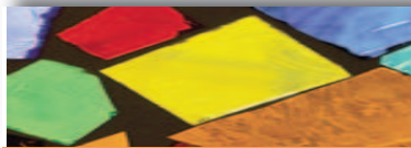
Mosaics of Faith Conference

The Drama Department presents “Almost, Maine,” at 8 p.m., Mar. 1, 2 and 3 in upstairs Jones Hall. Cost is $5 for UST students, faculty and staff; $10 for students and seniors; $15 for the general public. For more information or to reserve tickets, contact 713-525-3520.