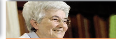
Chiara Lubich Memorial Mass

Join Campus Ministry in Victoria, Texas for the student retreat “Down the Road with Jesus” from 2:30 p.m. on Friday, March 2 until 4 p.m. on Sunday, March 4. Cost is $20. Register in the Campus Ministry House, 4110 Mt. Vernon.