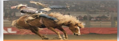
Intramural Rodeo & BBQ