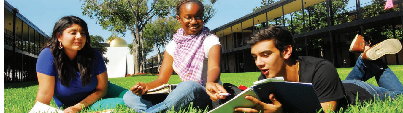
Fall 2012 Issue